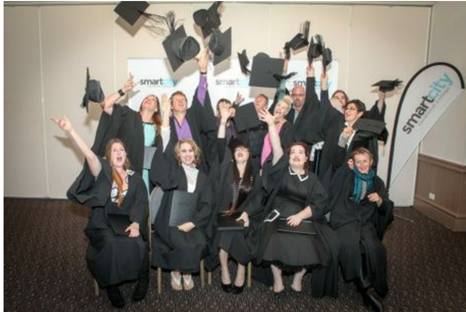
BETTER DAYS: A SmartCity graudating class in 2015.

There are SmartCity campuses offering a range of courses in Armadale, Bundaberg, Cairns, Caloundra, Elizabeth, Fairfield, Gympie, Hervey Bay, Hobart, Inala, Ipswich, Kippa-Ring, Launceston, Maroochydore, Morayfield, Rockhampton, Toowoomba and Townsville.