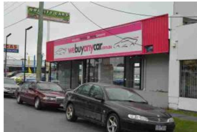
WeBuyAnyCar has gone into liquidation, leaving people out of work and out of pocket.

THE closure of a Dandenong car yard has left people unemployed and customers out of pocket, while the owner has fled overseas.