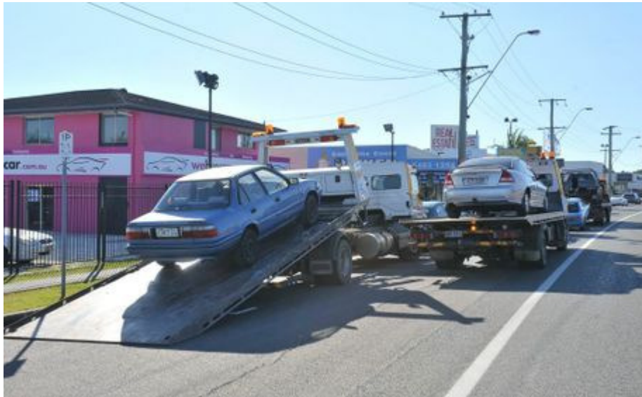
A fleet of tow trucks

were called to empty a car yard from We Buy Any Car in Currimundi after it closed its doors. john mccutcheon