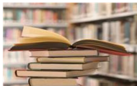
Alto Books: Local Australian publisher

Alto Book's website has been suspended and its phone line at its Buderim site is disconnected. ProPrint contacted Worrells for comment however the liquidators were unavailable.